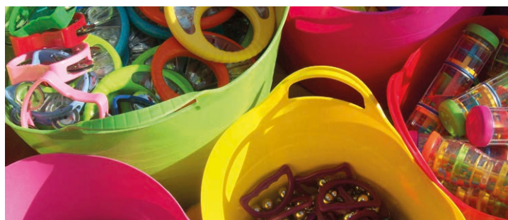
Musical instruments at the ready for Calypso kids

This is just a selection of the events planned – please contact the various sports clubs and venues around the town check the latest additions to their programme.