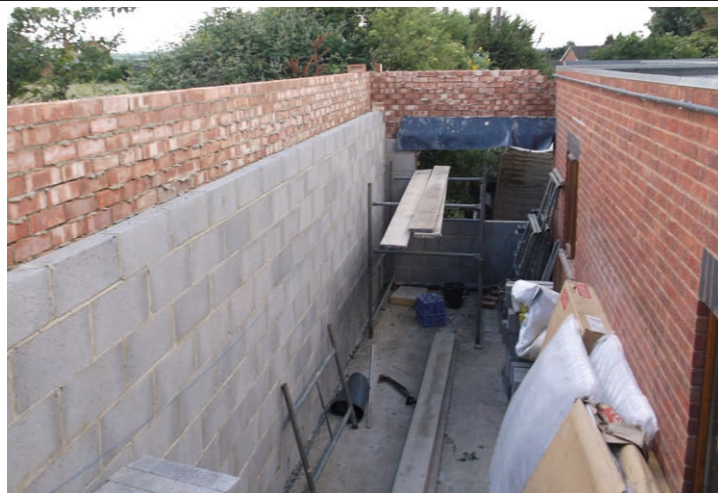
The new extension is taking shape

The building work is well under way and expected to be completed by the end of July. For more information, contact