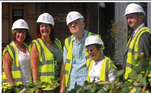
Rosedale residents join Mencap staff to check out the work in progress

Congratulations to the players, coaches and all those who support the team on bringing home so much silverware!